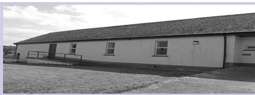
Hall building in 2011

As many people in the community want to see it become an attractive and welcoming community space once again a project to renovate it has begun. Dunhill Community Hall Committee has been set up under the umbrella of DFBA Community Enterprises Ltd to co-ordinate this work. A long-term lease on the building has been signed on behalf of the community with the Dioceses.