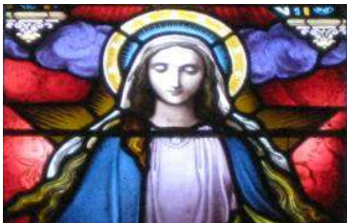
Detail of Mary from the east gable window.

STAINED-GLASS WINDOWS (W): The main window shows Mary and her parents, St. Anne and St. Joachim. Photo close-ups are on the parish website.