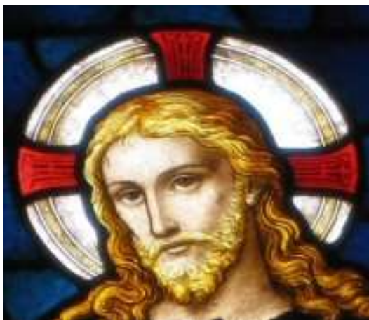
Detail of Jesus from the west gable window.

STAINED-GLASS WINDOWS (W): The main west gable window shows Jesus and his Sacred Heart, his mother Mary, and her husband Joseph. Photo close-ups are on the parish website.